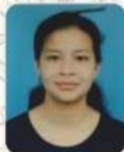
Dehuni Katdiani Nemcare Hospital, Guwahati (Ward)