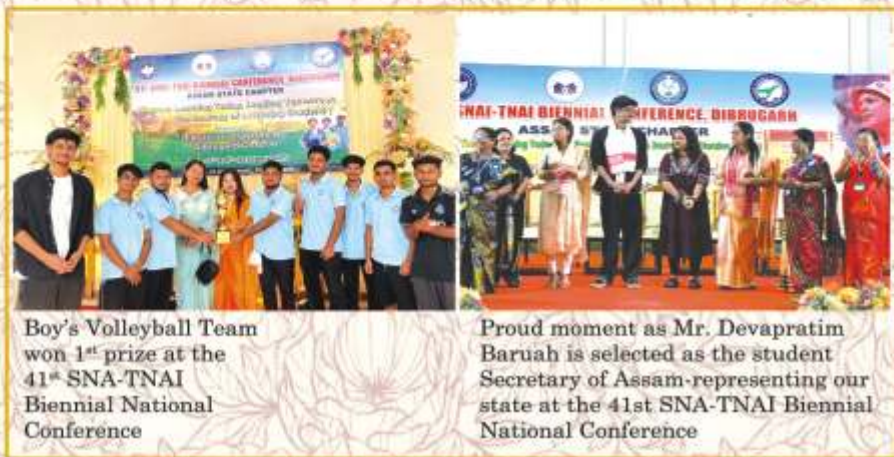
Boy's Volleyball Team won 1 st prize at the 41 st SNA-TNAI Biennial National Conference