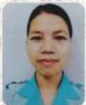
Rikmenlang Thongni Nemcare Hospital, Guwahati (OT)