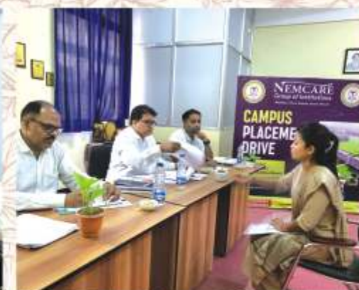
Campus Placement Drive conducted by Ajanta Pharma Limited on 6th June 2025 at NEMCARE Group of Institutions Mirza Assam