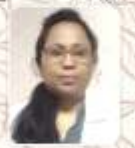
Sumita Mili Supercare Hospital Shillong