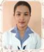
Disha Boseh Dhruvati Ambika Hospital, Bhakhri (Medical-Surgical ward)