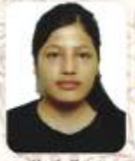
Urmita Chetry Uthraha Andhra Hospital, Marhisi (Hemodialysis Unit)