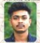
Pallab Jyoti Deka Moriganj Civil Hospital,