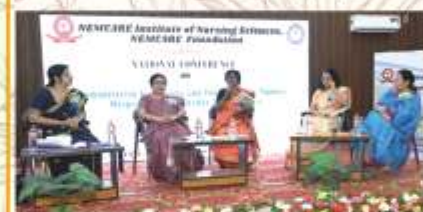
Panel Discussion on Translating Advancing Emergency Care Research to Everyday Practice