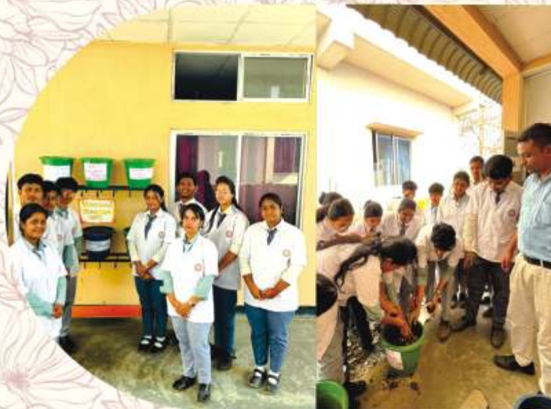
Vermicompost Production Unit at NGI. Students of Department of Biotechnology & FND producing Vermicompost from Organic Waste.