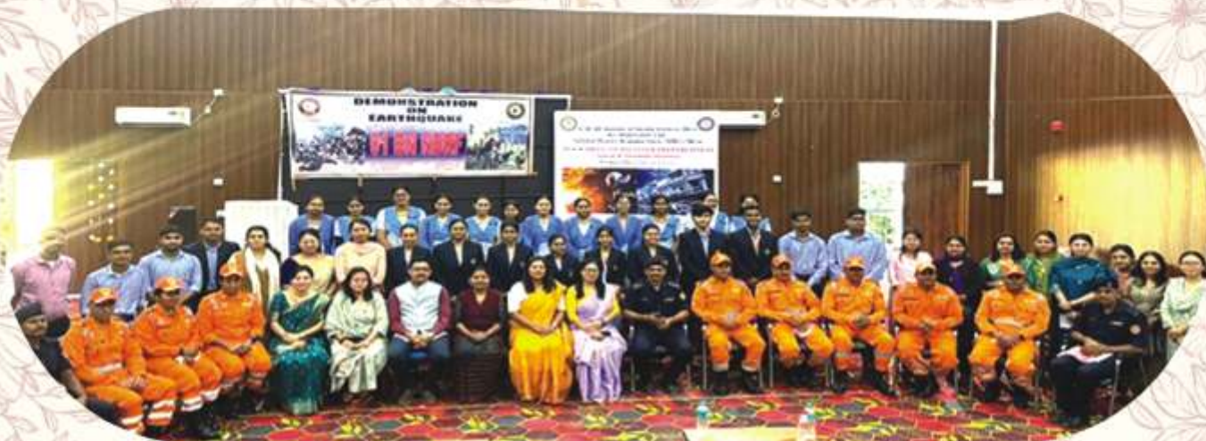
Mock Drill on Natural Disaster Preparedness organized at NGI Auditorium