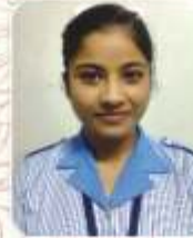
Ponam Das Nemcare Hospital, Guwahati (Neuro ICU)