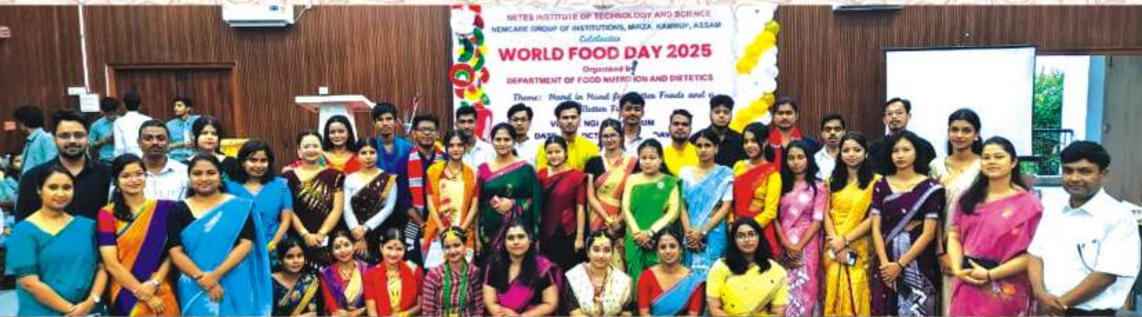
Celebration of World Food Day at NGI by the Department of Food Nutrition and Dietetics.