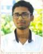
Vishal Parasur Cancer Care Hospital, TATA Iimg Hospital Pharmacist