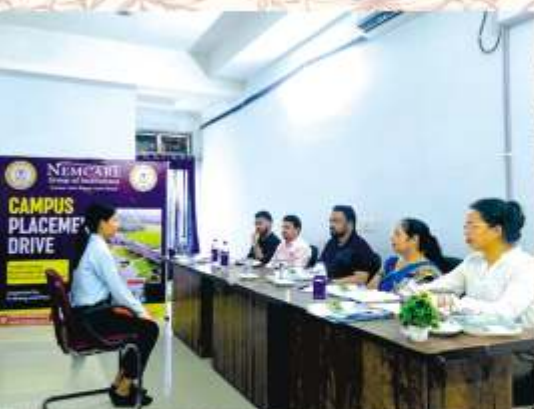
Campus Placement Drive of MHA students at NEMCARE Group of Institutions, Shantipur Mirza Assam