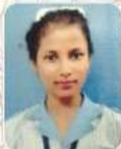
Endorbaryllawnehmong Nemcare Hospital, Guwahati (NICU)