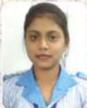
Swapna Deka Nemcare Hospital, Guwahati (Ward)