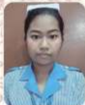
Shriya Hojai Nemcare Hospital, Guwahati (Neuro ICU)