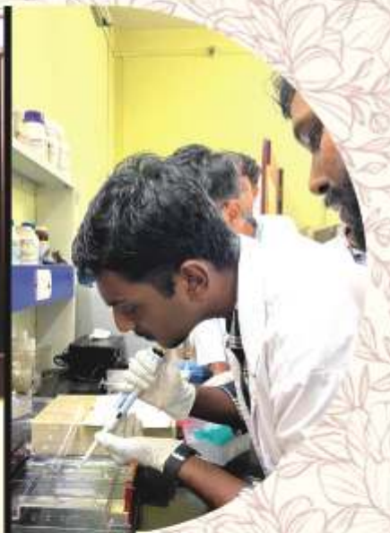
B.Sc. Biotechnology 3 rd Semester students performed Hands-on Training Programme in Basic Molecular Tools Organized at Dept. of Biotechnology, Gauhati University.