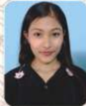
Tinkumoni Sonowal Nemcare Hospital, Guwahati (Neuro ICU)