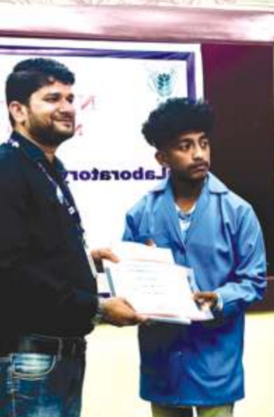
B.Sc. Biotechnology 3 rd Semester students performed Hands-on Training Programme in laboratory techniques for genome editing workflow in animals organized by ICAR-National Research Centre on Pig.