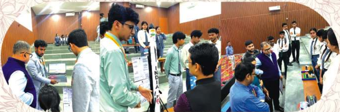
Celebration of National Science Day at NGI by the Department of Biotechnology & Food FND.