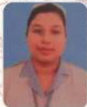
Bhupali Saharia Nemcare Hospital, Guwahati (Cath Lab)