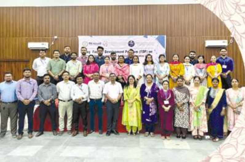
Faculty Development Program (FDP) on Strategic Implementation of Artificial Intelligence (AI) in Modern Scientific Education System as per National Education Policy 2020