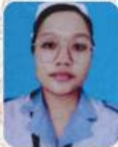
Vanlahini Nemcare Hospital, Guwahati (Ward)