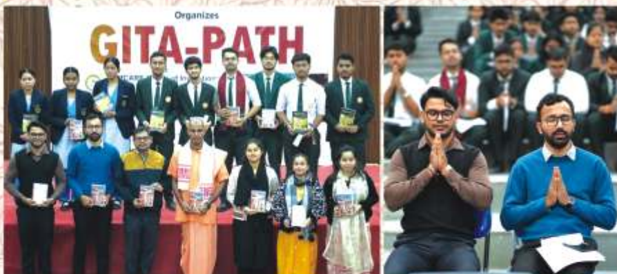
GITA-PATH at NEMCARE Group of Institutions, Mirza Assam on 19th December 2025 in association with HARE KRISHNA MANDIR, North Guwahati