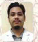
Kangkim Boro GMCH