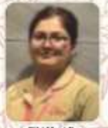
Ekl Masi Das Assam Cancer Care Foundation, Tata Trust Borpetta (ICU bedded ward)