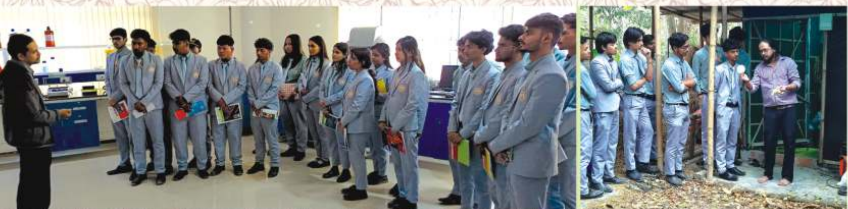
Different training programs organized for the students of Department of Biotechnology, NGI