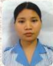
Yophika Thabeh Nemcare Hospital, Guwahati (Burn unit)