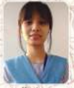
Nivedita Nemcare Hospital, Guwahati (MICU)