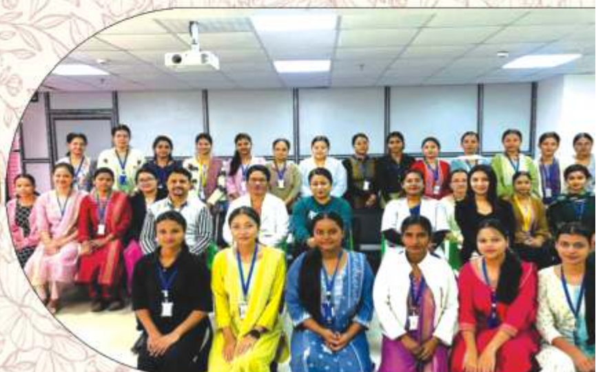
Placement Drive for Final Year GNM Students at Nemcare Super Speciality Hospital, Guwahati